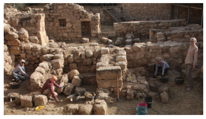
Documentation and preparation work at the site of the planned Madaba Regional Archaeological Museum, May 2016

The metal cover was designed by DOA staff with SCHEP team involvement. SCHEP team members were also able to advance the presentation and interpretation of the Bayt Ra's tomb by working with a local company to produce a 3D panoramic tour of the tomb interior using Virtual Reality (VR) technology. The VR devices are available on site and at ACOR. One of the metal caravans beside the tomb entrance was transformed into a gallery equipped with a screen to present videos and graphics related to the history of the ruins and the progress of the work.