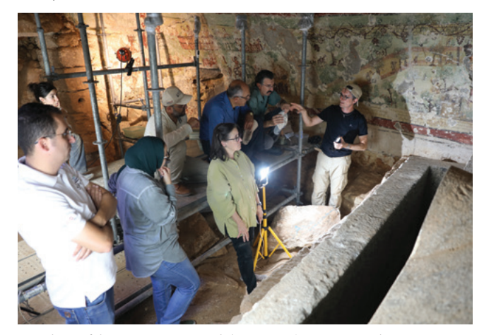
Members of the SCHEP team and the Bayt Ra's international consortium, with the DOA, inside the tomb during excavation work in September 2018

In terms of site management and development, SCHEP has played a significant role at the painted Roman tomb at Bayt Ra's near Irbid. Since the tomb was discovered in 2016, an international consortium was formed to oversee its management, and a series of excavation, documentation, and conservation missions have been conducted. During an eleven-day mission in September 2018, funded and supported by SCHEP and supervised by Institut français du Proche-Orient (Ifpo) with the DOA, experts conducted excavation in both rooms of the complex, conducted photogrammetry documentation of the wall paintings, and excavated, recorded, and studied the sarcophagus and the bones within. See ACOR Newsletter 29.2 for more on SCHEP's efforts at Bayt Ra's.