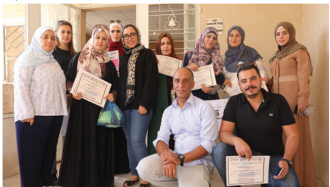
The participants in the MRAMP training on Artifact Organization and Display after receiving their certificates in Madaba, December 2018

SCHEP also provided a series of training and professional development opportunities through its partnership with MRAMP, including a three-month internship program for five architecture students from the American University of Madaba (AUM). The focus of the work was on data collection and analysis to help the museum architects from Studio Strati in Italy with their plans for an intended future museum. To ensure museum employees learn best practices in museum management, SCHEP and MRAMP conducted a number of training courses in handling and displaying objects, data entry, and a variety of other skills.