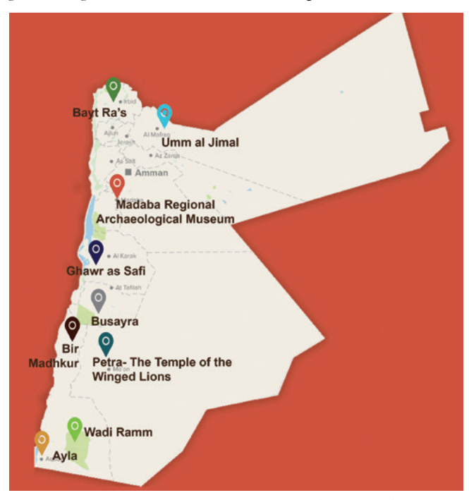
Map of SCHEP-supported sites throughout Jordan (2014–2018)

One of SCHEP's aims is to foster a holistic approach to cultural heritage resource management by utilizing a grassroots social engagement model that emphasizes local communities as the primary stakeholders. Accordingly, SCHEP worked with various principal investigators at nine sites throughout the country over the project's first phase to conduct interventions, support the development of Small to Medium Enterprises (SMEs), conduct training, and more. SCHEP's involvement at each site varied according to its specificities, in some cases supporting pre-existing projects or organizations, and in others beginning new projects in partnership with local and international organizations.